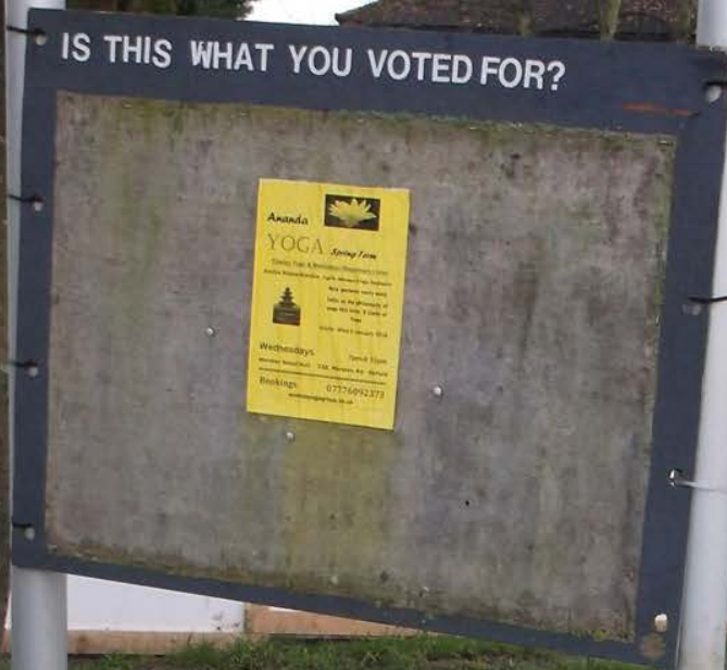
Existing notice board